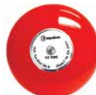
Red Enamel Bell